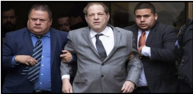
Harvey Weinstein was part of the Hollywood glitz and glam as a film producer but quickly fell from grace as he was accused of sexual misconduct. He was found guilty and is a convicted sex offender. He is now serving a prison sentence in New York.

Harvey Weinstein was sentenced Wednesday in a New York courtroom to 23 years in prison, the culmination of a case that fueled the global #MeToo movement and encouraged women to speak out against sexual abuse.