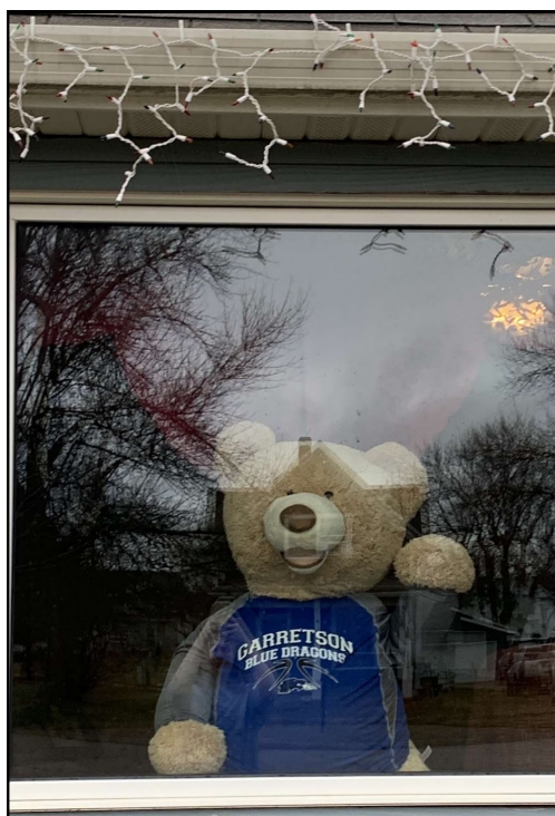
Garretson has joined together to put together a teddy bear hunt based on the book "We're Going on a Bear Hunt". Residents have placed teddy bears and other stuffed animals for people to find are town. On a count from a local child, over 200 animals in the window.

Yesterday, The Treasure Chest started to put puzzles out in front of their shop for people to take. Since the shop closed, due to COVID-19, they have been finding new ways to still help the community and encourage anyone to take a puzzle but to